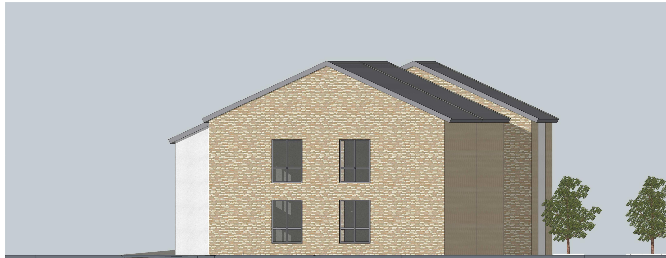
② Existing East Elevation